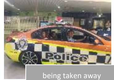
being taken away