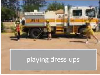
playing dress ups