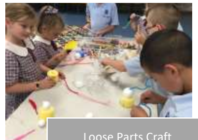
Loose Parts Craft