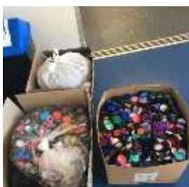
so many lids