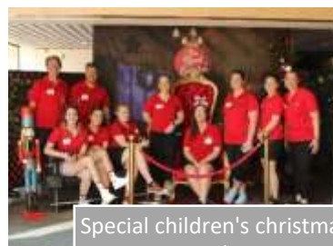
Special children's christmas party