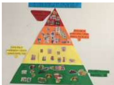
Healthy Food Display

Healthy eating display and menu planning