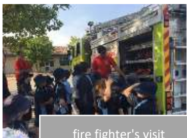
fire fighter's visit