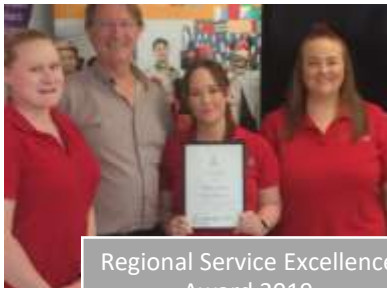
Regional Service Excellence Award 2019